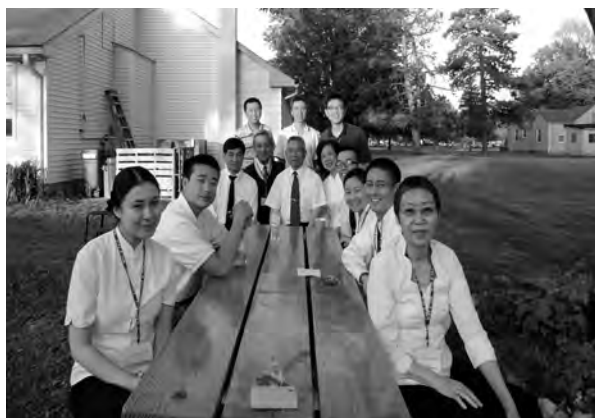
▲ 世外桃源——以心印道心。

第二天他們出現了！兩位大德真有大福報，跟佛有大因緣。一起坐下來聆聽點傳師們講述道義和前賢們用心準備的影片和道歌。中午一起吃午齋時，坐在一位祖母級的前賢旁，感受她的態度樂觀開朗、身體康健，生命有方向，內心散發出安詳和活力。為人子女孝順父母的最高境界，不就是帶給父母快樂安詳的生活嗎！在異鄉美國，中堂對老人家來說就更顯得重要，晚上含飴弄孫，白天或假日在中堂讓生命再次展現。我們在棉花樹下，享受健康美味的素食，討論著上