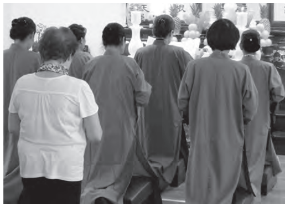
▲ 開壇盛典—隆重請壇禮。