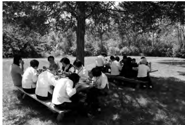
▲ 樹蔭下愉快用餐與交流。

更令人感動的是，道院擁有五星級的衛生間！感恩打掃衛生間的前賢們，讓家有這麼乾淨清潔的環境。